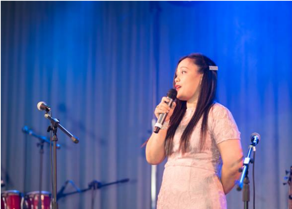
Address & Video presentation by Salad Master - Platinum Sponser 2