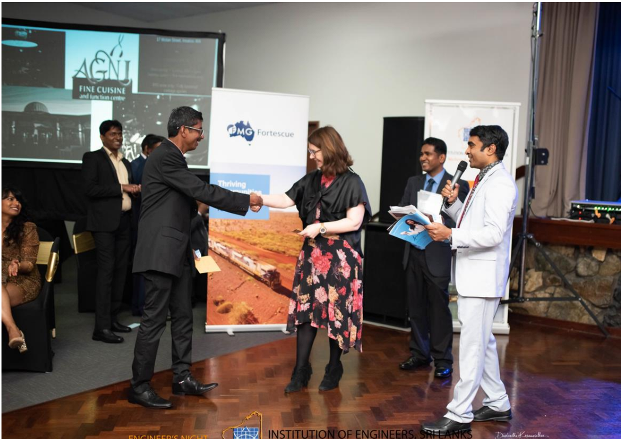
Door Prizes – Draw & Presentation