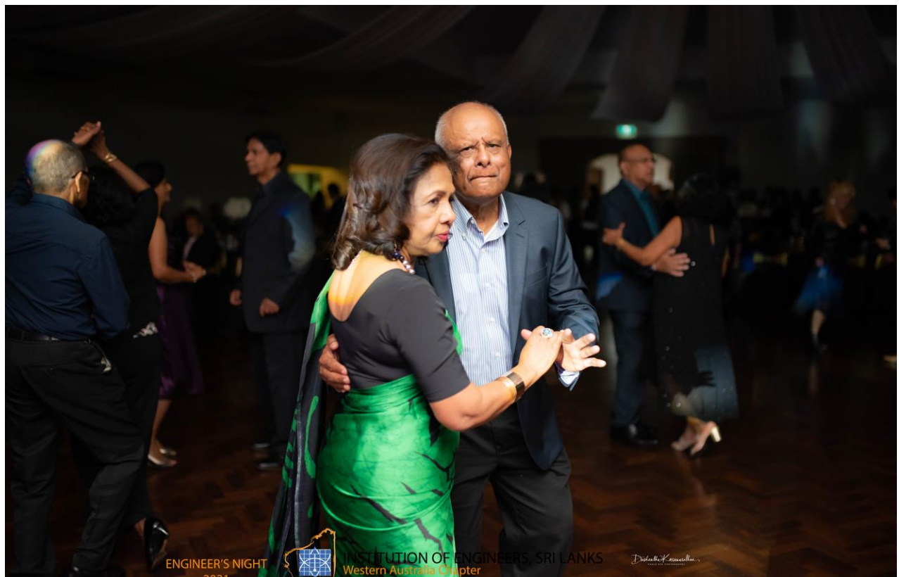
Band music and Dance session 1 by "Swasthi"