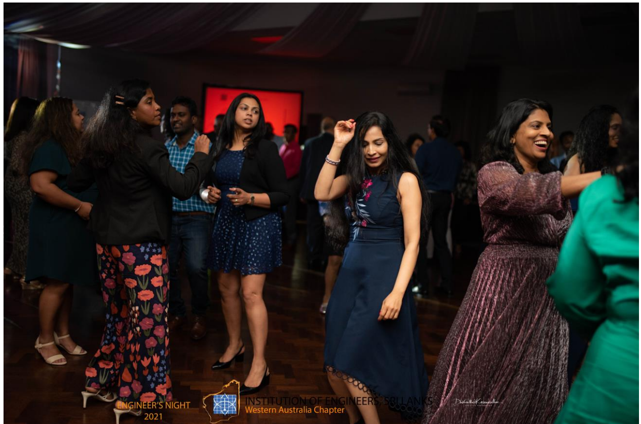
Band music and Dance session 2 by "Swasthi"