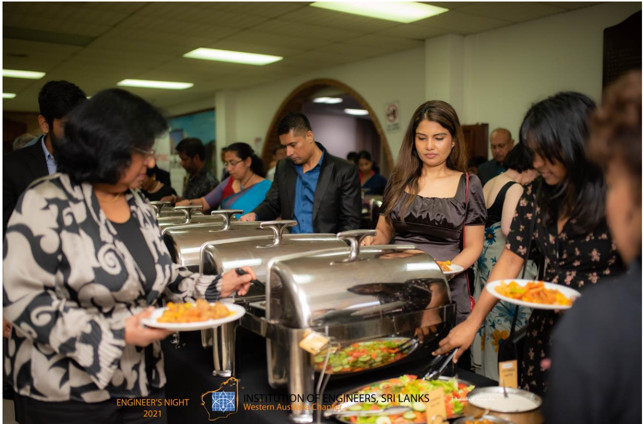
Dinner with light music by "Swasthi" Sri Lankan band