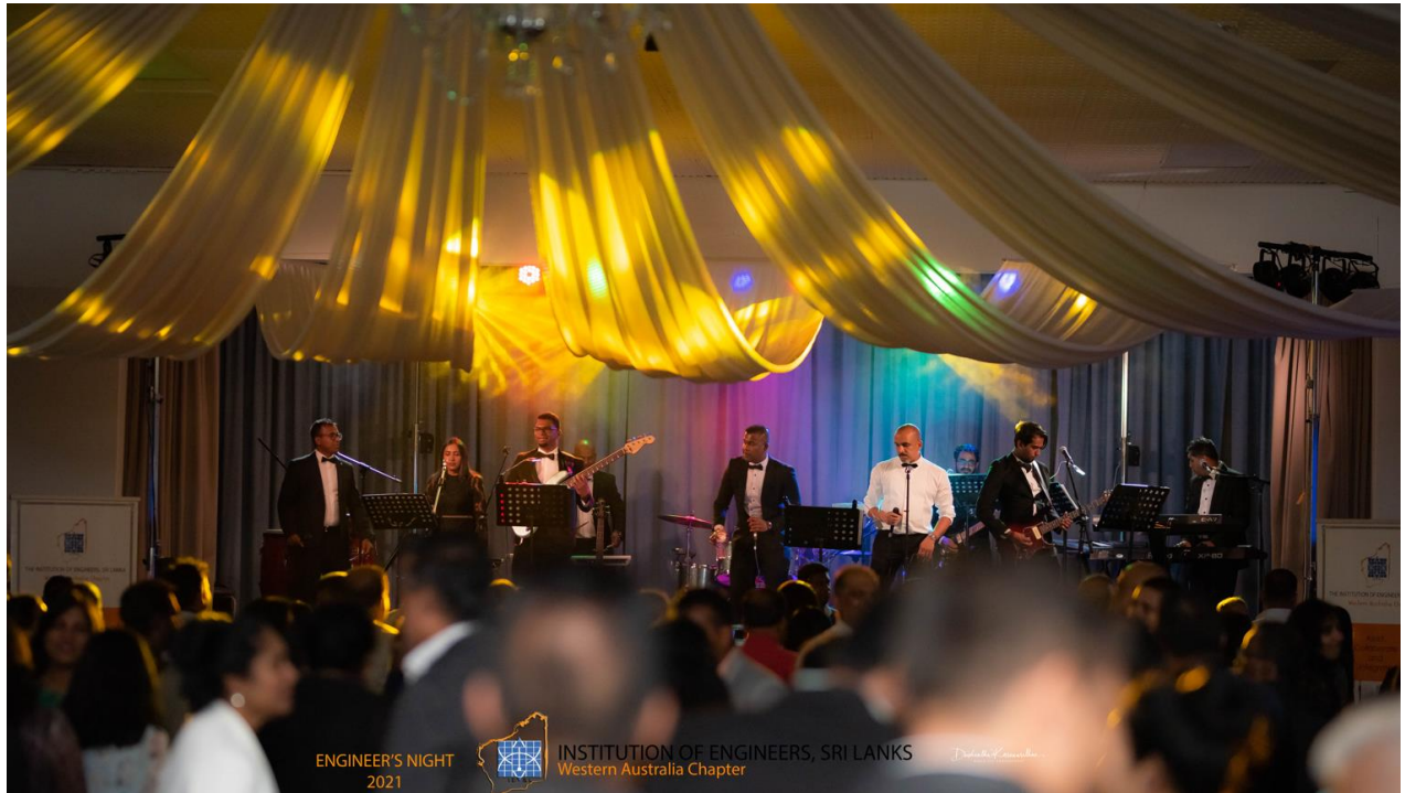
Band music and Dance session 2 by "Swasthi"