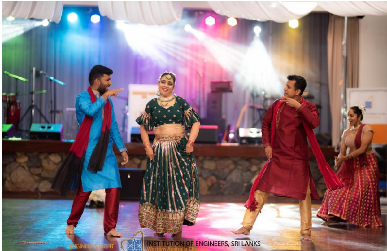
Sri Lankan "Bollywood Inspired" dance performance by Sri Lankan Academy of Creative & Performing Arts