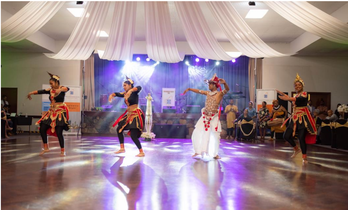
"Kandyan Dance Fusion" by Sri Lankan Academy of Creative & Performing Arts