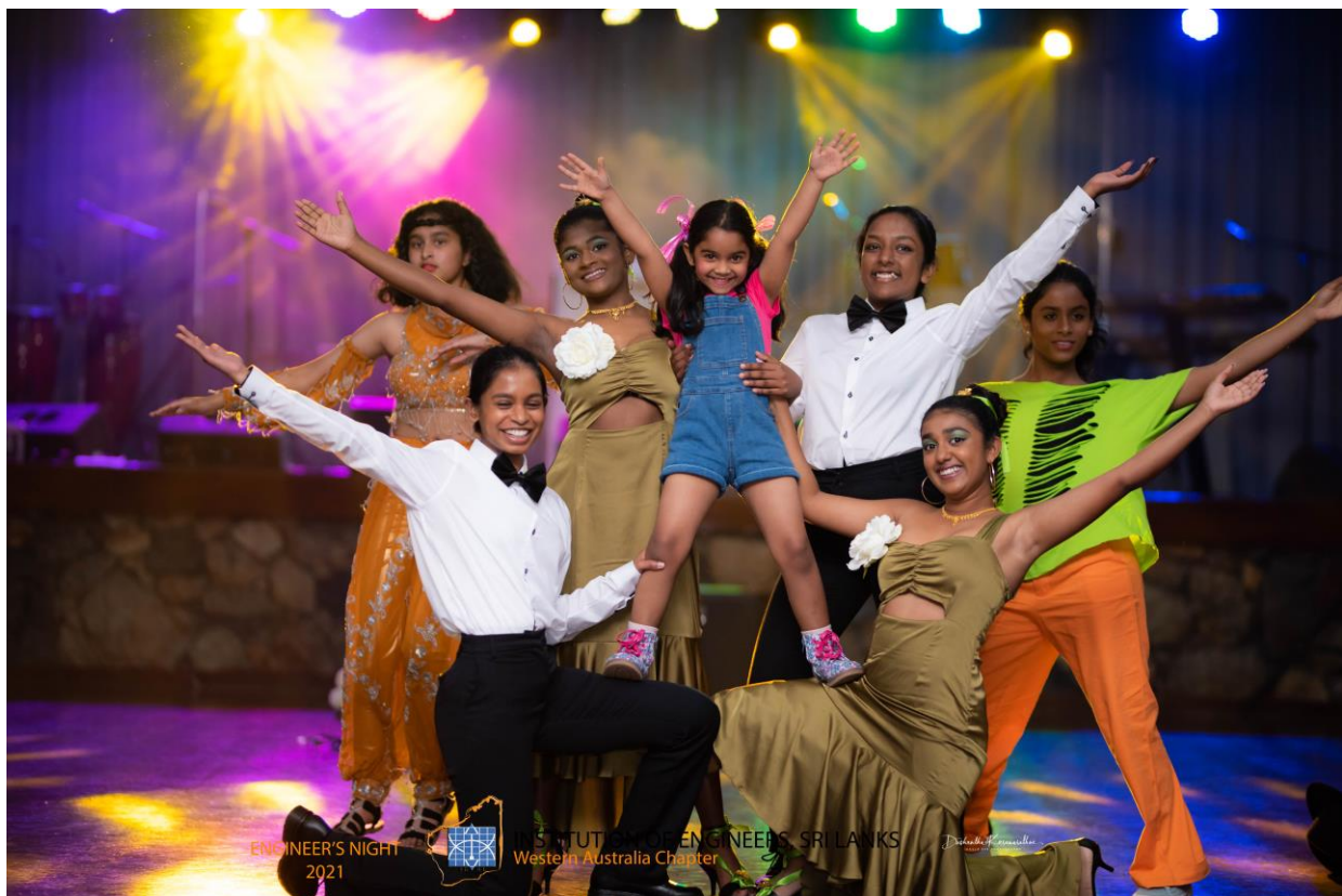
Sri Lankan "Western Inspired" dance performance by Sri Lankan Academy of Creative & Performing Arts