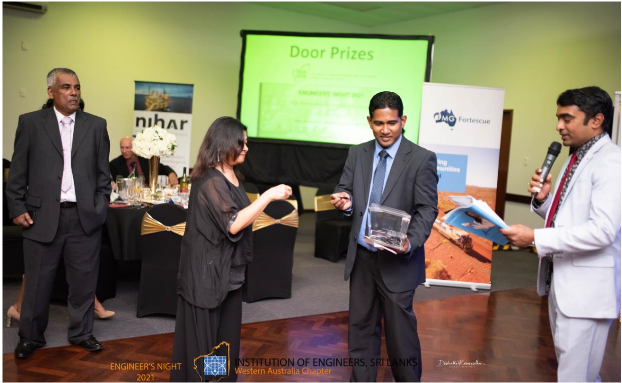
Door Prizes – Draw & Presentation